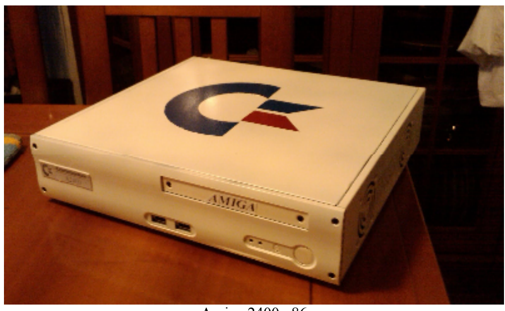
Amiga 2400 x86